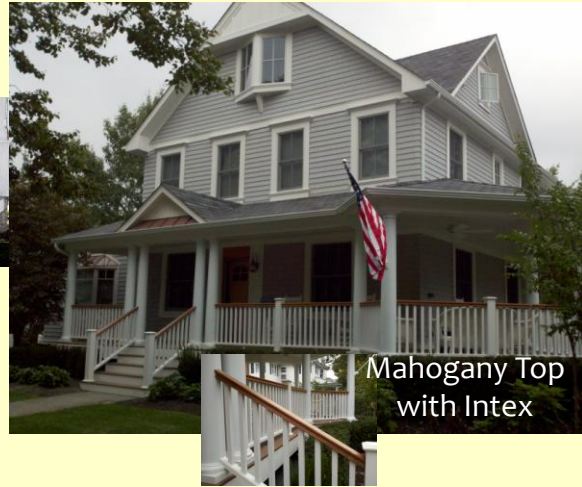
Mahogany Top with Intex